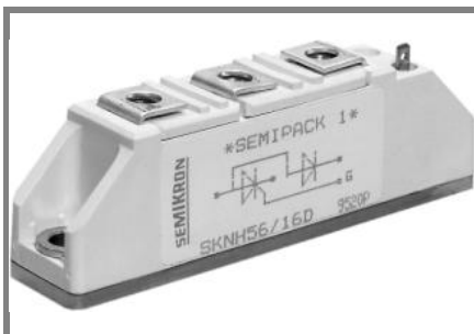
SEMIPACK ® 1